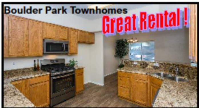
Boulder Park Townhomes