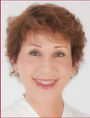
18 Years Broker/Owner