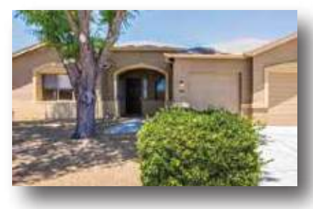
6688 Glenna Court Granville $385,000 MLS#1012759