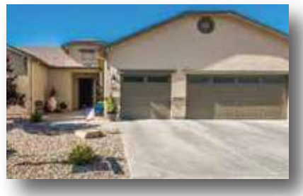
6368 Jaden Lane Granville $425,000 MLS#1012653

1004 N Wide Open Trail Stoneridge $470,000 MLS#1010919