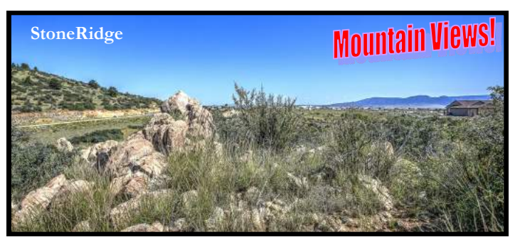
StoneRidge Custom Home Vacant Lot on Desired Custom Homes Only Street. Nice .57 Acre Lot near Cul-desac with Great Views of the Mingus Mountains, City Lights & Valley Views!! Beautiful Unique Boulders on this Lot with Perfect Area for Round Driveway Entrance. Utilities are to the Lot, Public Water & Public Sewer. Architectural Guidelines, Setbacks, & CC & R's Apply. See Attached Map. Good Association w/Low 175.26 Quarterly Dues, Includes Trash Service and Great Amenities. Great Area Amenities include Public Golf Course, Restaurant, 2 Swimming Pools, Spa, Locker Rooms, Fitness Center, Tennis, Basketball, Vollevball, Pickle ball & Activity Center.

6448 E Slow Cattle Drive, Prescott Valley AZ 86314