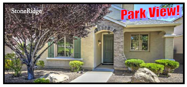
StoneRidge English ''Goldenrod'' Plan, 4BD/3BA/2GAR, 1966 SqFt, 2 Story Hm w/Park View near the Stoneridge Clubhouse! Granite Kitchen w/Bisque Appliances + Refrig, Sunny Dining Area, Medium Oak Cabinetry, Under Counter Lighting, Recessed Lighting, Pantry & Tiled Flooring, GreatRoom w/Carpe Flooring, Coat Closet, Under Stair Storage Closet, Wired for Surround Sound, Lighted Ceiling Fan & View of Covered Patio Area w/Sunny Windows & Sliding Door. Master BD w/Horizontal Blinds, Carpet Flooring, Ceiling Fan & Walk-In Closet, Clear Glass Shower, Dual Sinks, Tall Height Marble Counter, & Oak Cabinetry.

7206 E Night Watch Way , Prescott Valley AZ 86314