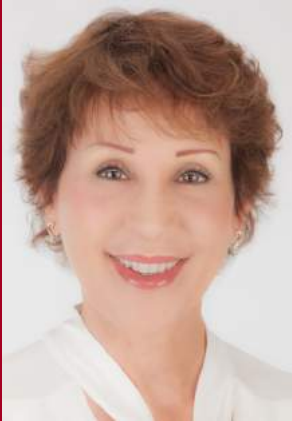
18 Years Broker/Owner

Are you looking for a Real Estate Agent that knows the housing market inside and out?