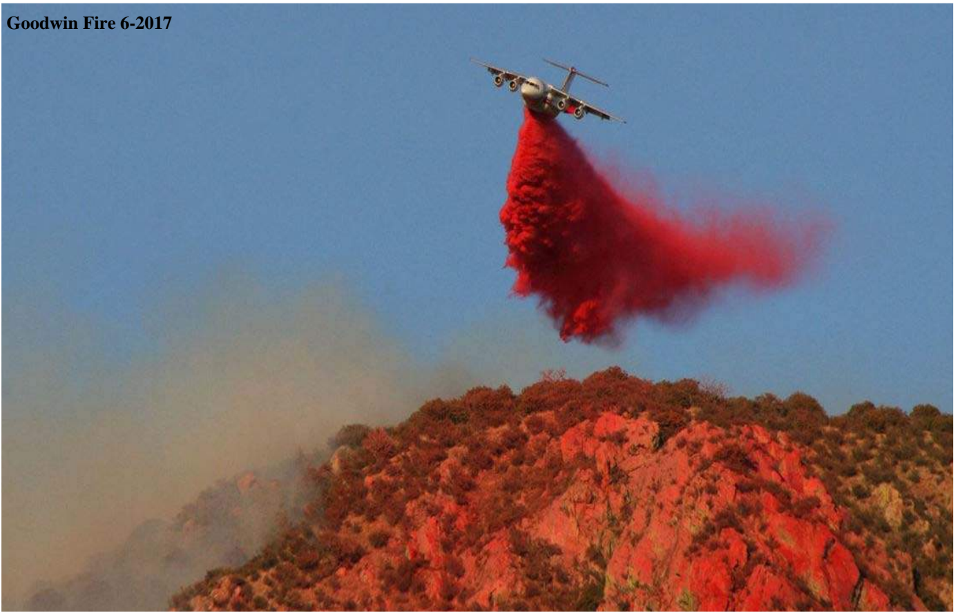
Goodwin Fire 6-2017