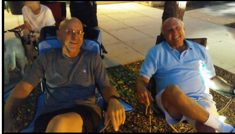
Great music, Great neighbors, GREAT NIGHT! Summer concert series, Crossfire band, July 2017