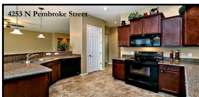
4253 N Pembroke Street

For Lease! Brand New Beautiful Granville Home with Panoramic Mingus Mountain Views! 3BD/2BA/2.5 Car Garage, 1661 SqFt. Tiled Foyer Entrance leads to Spacious Great Room with Cozy Corner Fireplace with Blower, Open Concept Granite Kitchen w/Pendant Lighting, Dining Counter Island, Closet Pantry, Recessed Lighting, Beautiful Staged Maple Nutmeg Cabinetry, Black Appliances including Refrigerator and Convection Oven. No Pets Please. 4253 N Pembroke Street, PV $1,650 per month.