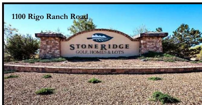
1100 Rigo Ranch Road