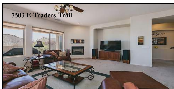
7503 E Traders Trail

Highly Desired StoneRidge Summit Plan! 2550 SqFt, 3BD + Bonus Rm/2.5BA/3Car Garage + Formal Dining/Den. Open Granite Kitchen w/Granite Dining Island, Tiled Informal Dining Area, Double Door Pantry & Upgraded Cabinetry. Large GreatRoom w/Cozy Gas Fireplace, Media Niche, Roll Up Window Shades, Large Windows & Lighted Ceiling Fan. Nice Master Bedroom with Slider to Rear Yard Patio, Big Windows & Executive Height Counter with Raised Sinks. 7303 E Traders Trail, PV $400,000.