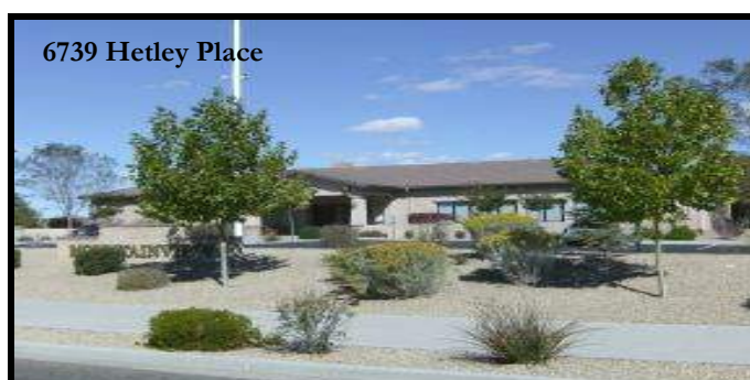
6739 Hetley Place