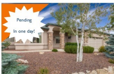
1425 Eureka Ridge Way, Copper Canyon