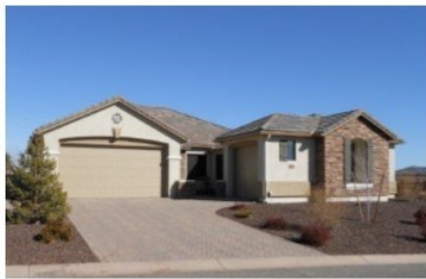
1239 Sarafina, Prescott Lakes