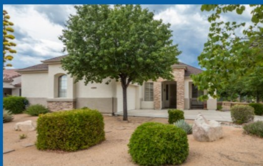
7044 E Lynx Wagon, StoneRidge $279,000