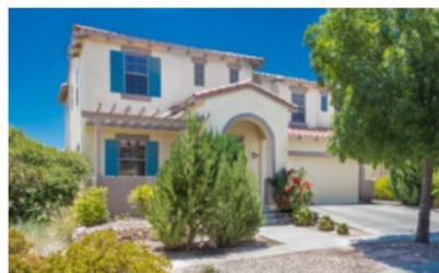
7183 E Grass Land, StoneRidge