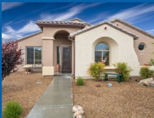
1135 N Buggy Barn, StoneRidge $285,000