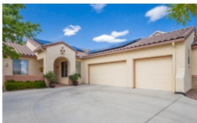
1728 N Colton Dr. StoneRidge